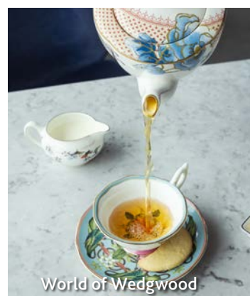
World of Wedgwood

PICK UP POINTS: 7.00 am Kirkby Lonsdale Square • 7.20 am Ingleton Bibby's Depot • 7.25 am Clapham Village Stores • 7.30 am Austwick Bus Stop • 7.40 am Settle Whitefriars CP or Falcon Hotel • 7.45 am Long Preston Maypole • 7.50 am Hellifield Black Horse • 8.10 am Gisburn Bus Stop. Factory Tour included.